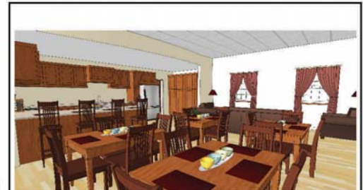
Dining Room Perspective View