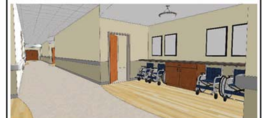
Corridor Perspective View