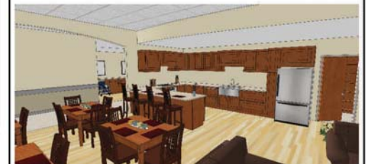
Kitchen Perspective View